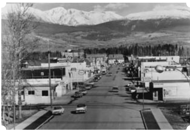
The present museum building at the foot of Main Street, Smithers, 1950.