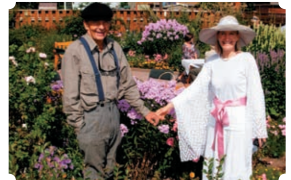
The Old Church Gardens